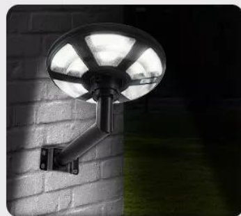
Automatic light on at night